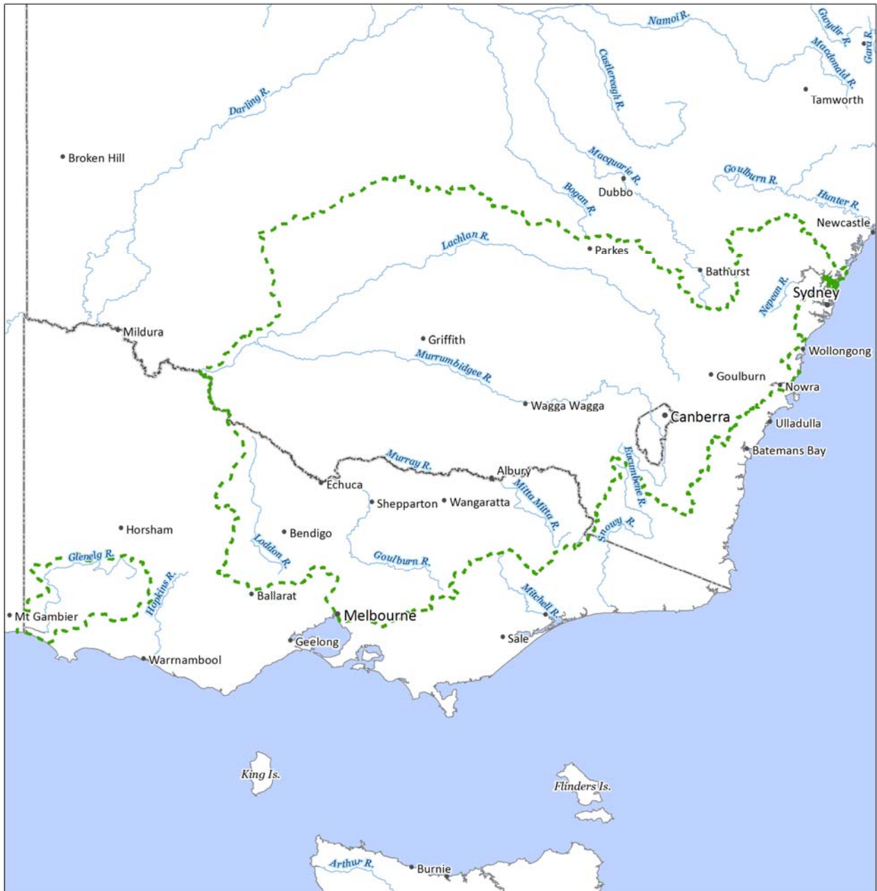
Map 1: Catchments in which waterways may support the Macquarie perch ( Macquaria australasica )

INDICATIVE MAP ONLY: For the latest departmental information, please refer to the Protected Matters Search Tool at www.environment.gov.au/epbc/index.html