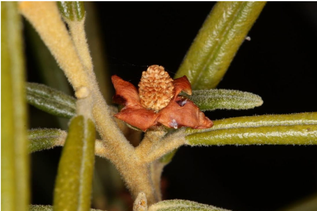
Photo of male Bertya sp. Clouds Creek flower

This document combines the approved conservation advice and listing assessment for the species. It provides a foundation for conservation action and further planning.