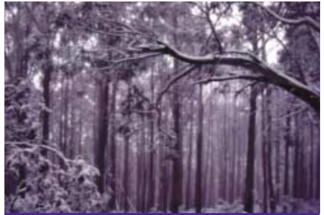
Stands of alpine ash covered in snow on Mount Buller, Vic (above) and at Thredbo, NSW (below)