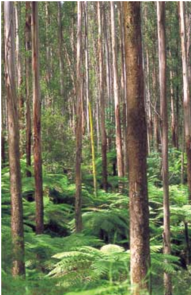
Regrowth mountain ash forest, Healesville, Vic

Ash forests in Australia's relatively high rainfall areas cover important water catchments. For example, water for the city of Melbourne comes from some 155 000 hectares of forested catchment in the Victorian Central Highlands, about one-half of which is mountain ash forest. This one-half yields about 80% of the streamflow because of the high rainfall. Long-term research in these catchments has shown streamflow from regrowth forests that regenerated after the 1939 bushfire decreased markedly relative to streamflow from old age forest in the years before the fire. Models indicate that streamflow from regrowth forest decreases over the first 20 – 30 years to about 50% of that from old age forest and then increases to equal that from old age forest at about 150 years. The age-structure of the mountain ash forest of the Victorian Central Highlands is now well within the range where streamflow from the catchments is increasing, and management is based on that premise.