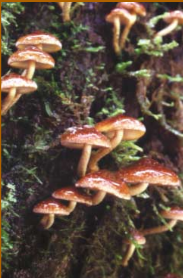
Fungi decorate a myrtle beech tree in a mature ash forest

Regional Forest Agreements will be reviewed regularly. Forest management, both off and on reserves must be flexible and adaptive to new scientific knowledge, changing community expectations, manufacturing processes and market conditions. With careful management, ash forests will continue to provide a wide range of aesthetic, conservation and production values to the Australian community.