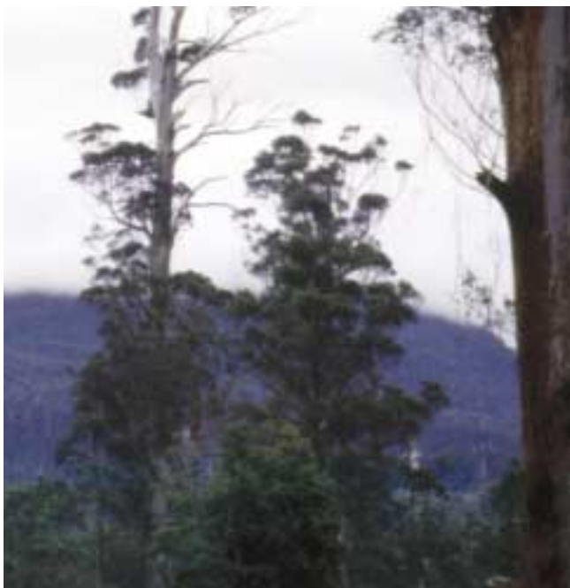
Old growth forest reserve in Tasmania showing characteristic signs of crown die-back

Loss of hollow-bearing trees is a major threat to the fauna that depend on them. For example, Leadbeater's possum expanded rapidly after the 1939 fires as a result of the regeneration of wattles on which it feeds. The large living and dead ash trees which remained standing following these fires provided nesting hollows. However, these trees are slowly disappearing through continued decay and collapse. While these will be replaced once the regrowth forests mature, the maintenance of viable populations of hollow-nesting fauna requires active management to provide suitable habitat.