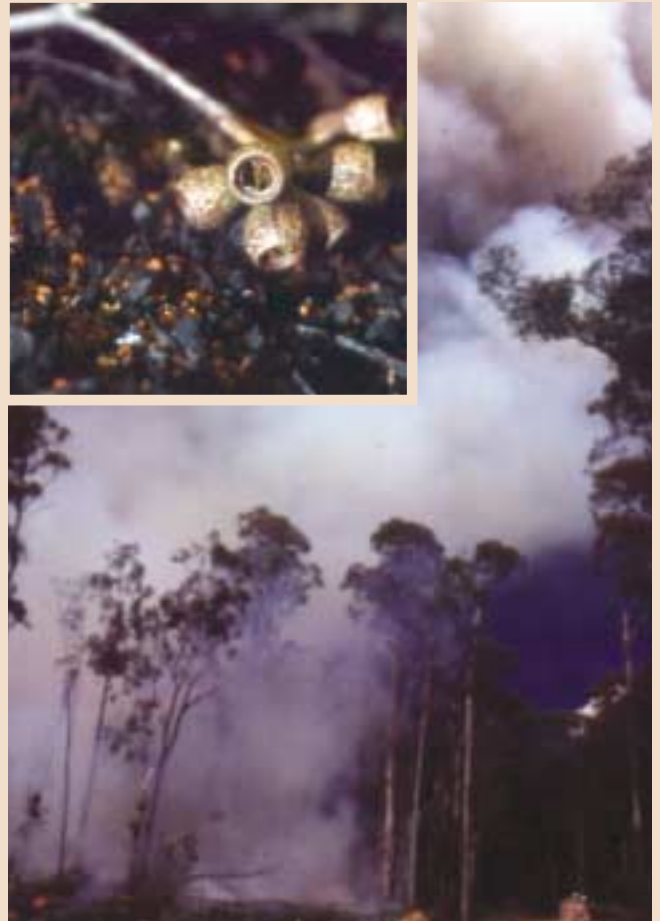
A regeneration fire in a messmate forest, north east Victoria

The early rapid growth of mountain ash and alpine ash after fire is due both to lack of competition from other species and to the ash bed created by intense fire. The growth rate of seedlings on fire-heated soil is many times greater than that on unheated soil.