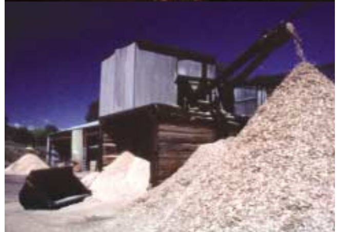
(Top) Cross-cutting alpine ash logs in Bago Forest, NSW