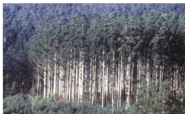
Mountain ash regeneration following 1939 bushfires in the Toolangi District, Vic—showing typical uniform growth

Mountain ash ( Eucalyptus regnans ) is the world's tallest flowering plant (or angiosperm), reaching a height of up to 110 metres. It is mostly confined to the mountains of the eastern half of Victoria at altitudes of 150 to 1 100 m (with smaller occurrences in western Victoria in the Otway ranges). In Tasmania it occurs from sea level to 600 m in the north east, south east, and in the valleys of the Derwent and Huon Rivers. The species name (from regnare —to rule) is appropriate to the immense height, girth and dominance of the trees. The common name 'mountain ash' is most widely recognised, but 'swamp gum'