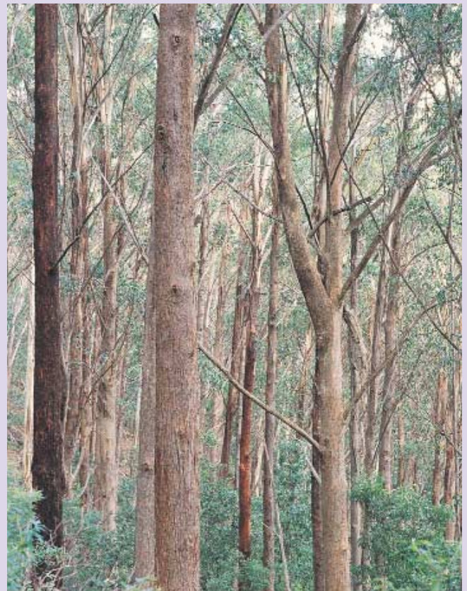
The thick lower bark of cut-tail/brown-barrel makes it relatively fire-resistant