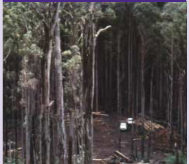
(Below) A stand of regrowth messmate stringybark in Powelltown, Vic

Eucalyptus obliqua was the first eucalypt to be named and described. It was collected on Bruny Island, off south eastern Tasmania, during Cook's third voyage, and was described by L'Héritier in 1788. The type specimen is held in the British Museum. As Brooker and Kleinig (1983) note, in choosing the name Eucalyptus (from the Greek eu and calyptos = well covered), L'Héritier 'perpetuated, most likely by accident, a feature common to all eucalypts—the operculum' (the cap of the flower bud).