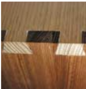
(Below) Ash species are also the most commonly used by furniture and cabinet manufacturers in that area