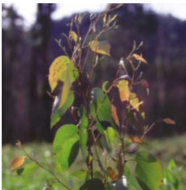
A mountain ash seedling