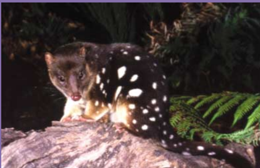
Ash forests harbour rare species such as the spot tailed quoll

The O'Shannassy Catchment is one of a number of catchments for the city of Melbourne that have been closed to timber harvesting and visitors, some since the late nineteenth century. The magnificent and often breathtakingly beautiful forests include three main vegetation communities: a fern-gully community dominated by myrtle beech in the wettest and most sheltered, medium-altitude gullies; myrtle beech/mountain ash forest on medium-altitude, protected slopes and gullies; and mountain ash forest on the medium-altitude, relatively exposed slopes. Much of the O'Shannassy Catchment has never been utilised for timber and approximately 80% of the area survived the 1939 fires. As a result the vegetation is old, rich and undisturbed. Many of the mountain ash trees are older than 200 years, often 75 m or more in height and provide abundant hollows which are important for a number of animal species.