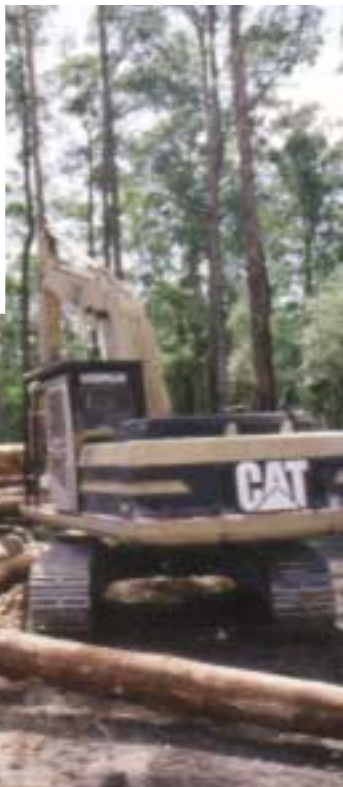
(Above) Log landing in regrowth mountain ash forest